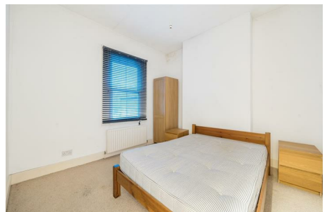
First Floor Flat Sulina Road London SW2 4EJ