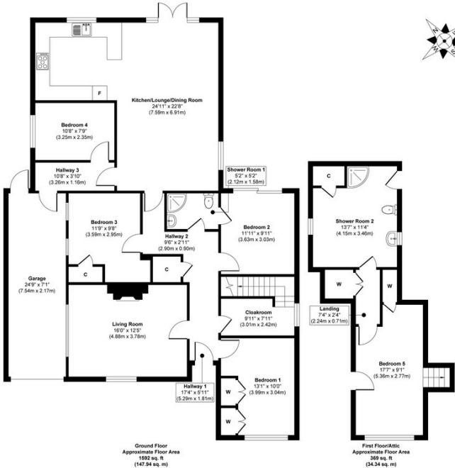
ME17 4NJ - 41 The Quarries

Approx. Gross Internal Floor Area 1961 sq. ft / 182.28 sq. m Whilst every attempt has been made to ensure the accuracy of the floor plan contained here, measurements of doors, windows, rooms and any other items are approximate and no responsibility is taken for any error, omission, or mis-statement. The measurements should not be relied upon for valuation, transaction and/or funding purposes. This plan is for illustrative purposes only and should be used as such by any prospective purchaser or tenant.